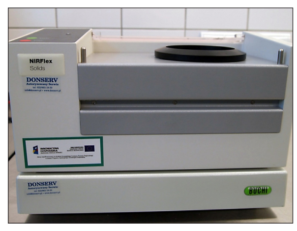
Fig. 3. Near-infrared spectroscopy analysis equipment

a high homogeneity of the analyzed sample, so the authors of the studies indicate that the meat, including pork, as a heterogeneous product is not the optimum product during the analysis conducted using the near-infrared spectroscopy, as the results are just approximate and this method cannot replace the reference methods, but on the other hand, allow obtaining a rapid, reproducible results.