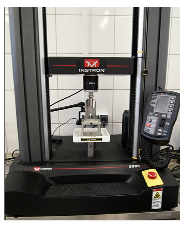
Fig. 1. Texture analysis equipment with the V-blade

tion of biting and chewing during the consumption of such food products is achieved. These methods used in a laboratory have a high suitability for detailed analysis, for example to focus on the dependencies associated with used breeding techniques and their impact on the final quality of meat (Fig. 2.)