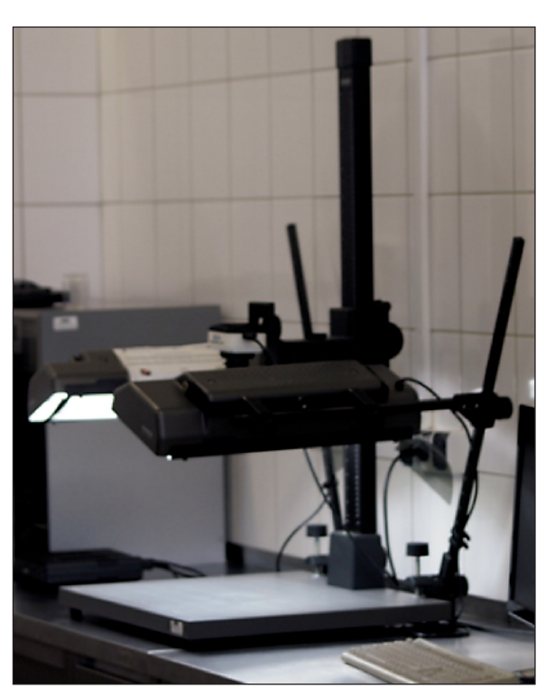
Fig. 4. Computer image analysis equipment

The computer image analysis method is used both in the laboratory and industrial scale. Moreover, it is possible to carry out analyzes of the carcasses (eg. classification performed on the automatic measurement lines using meat image analysis to assess the degree of fatness and conformation by EUROP classification), the culinary elements and individual steaks (slices of meat). It